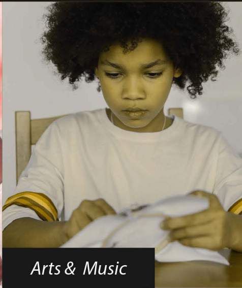
Arts & Music